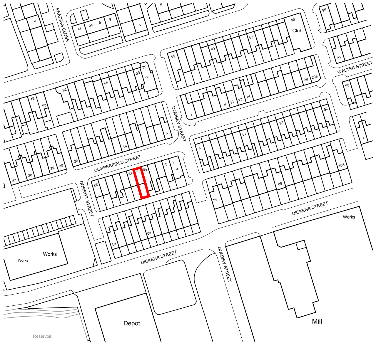
SITE LOCATION PLAN. SCALE 1:1250